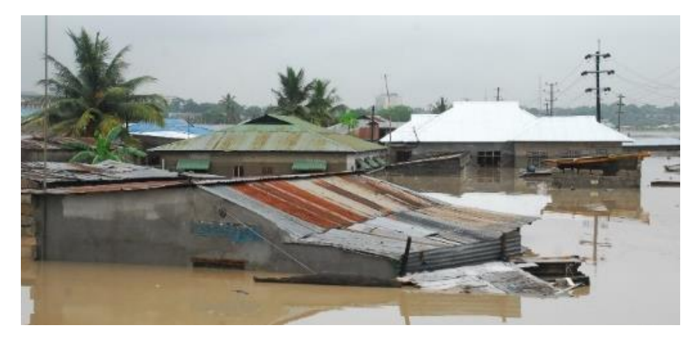
Flooding in Tanzania

All of our work is co-designed and co-delivered with our partners. The process of building capacity and co-delivering new consistent data will promote welfare and economic development and demonstrate the applicability of the techniques elsewhere. METEOR progress is tracked within the project by a dedicated Monitoring & Evaluation process that includes baseline, midline and endline interviews.