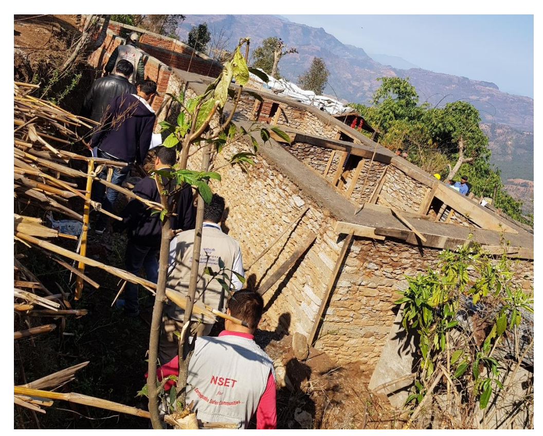
Gorkha Earthquake Reconstruction in Nepal

The escalating impacts of natural hazards are caused mostly by increasing exposure of populations and assets. Poor understanding of the distribution and character of exposure (buildings and infrastructure) in ODA countries is a major challenge when making Disaster Risk Management (DRM) decisions. Robust and quantitative methods are required to justify resilience decisions and risk mitigation.